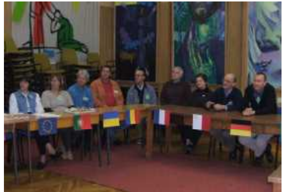
JRS Europe staff at the AGM, Samobor, Croatia

The 2007 JRS Europe Annual General Meeting was held in Samobor, Croatia from 11 – 14 October. Nearly 70 participants attended representing 19 different countries. The circumstances in each European country vary a lot, as do the type of services offered to refugees and asylum seekers in these countries. The size of JRS country teams also varies, from large teams in Italy and Portugal to newer teams in Europe of a few dedicated staff. JRS was pleased to welcome representatives from the offices in Sweden and France, which are continuing to develop new initiatives to respond to the needs of refugees and asylum seekers in their countries.