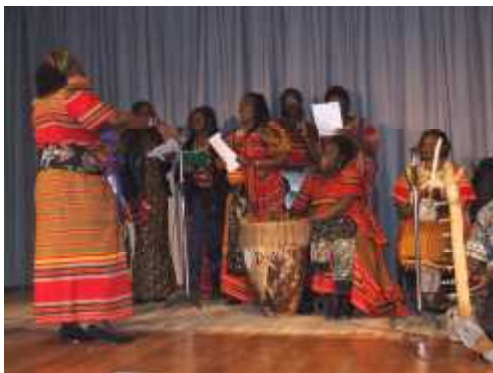
The Acholi Choir